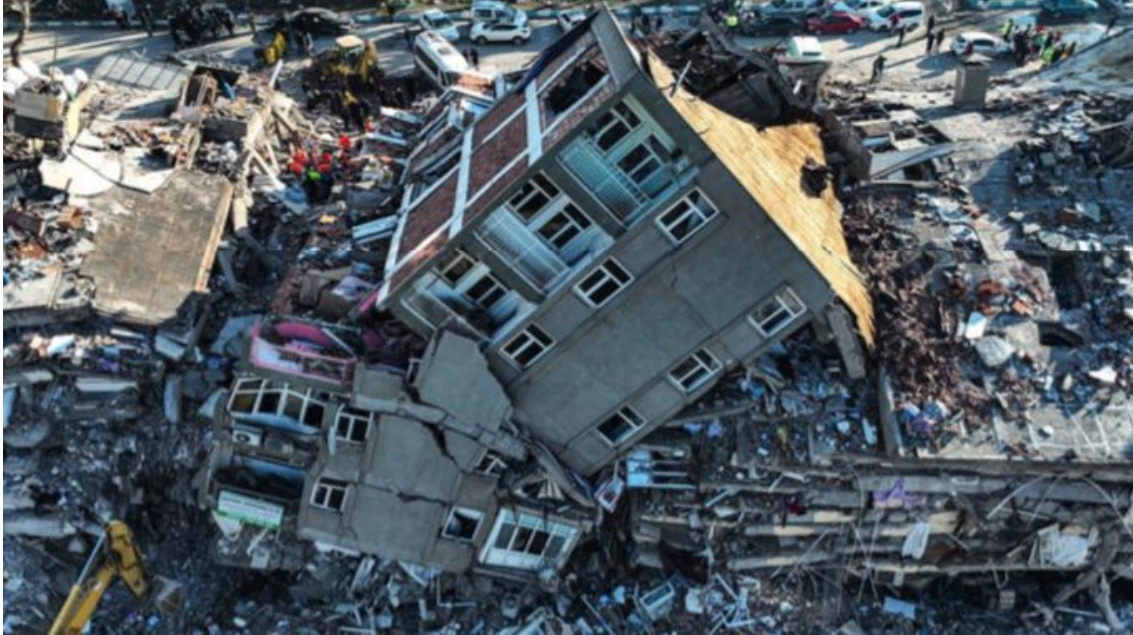
Deadly quake strikes Turkey and Syria