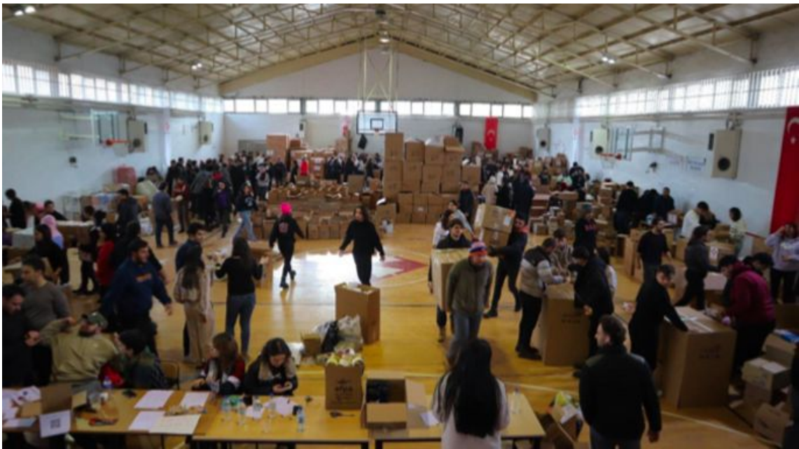
Baskent University students during preparations of aid supplies