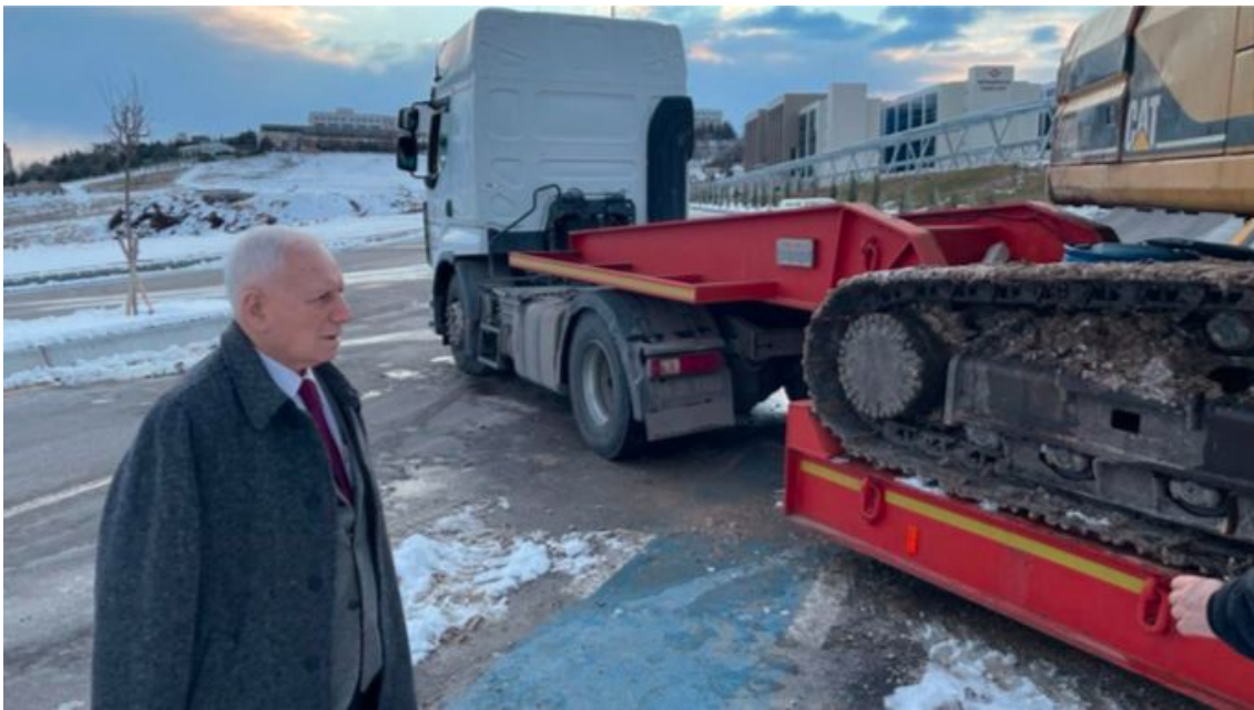
Heavy-lifting construction equipment needed for the rescue efforts were immediately sent to the earthquake zone.