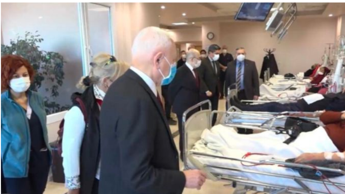
Patients who were brought to Baskent University Adana Hospitals and dialysis centers