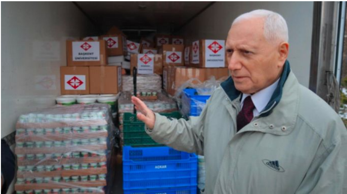
12,5 tons of dairy products produced by Baskent Univeristy were sent to the reigon