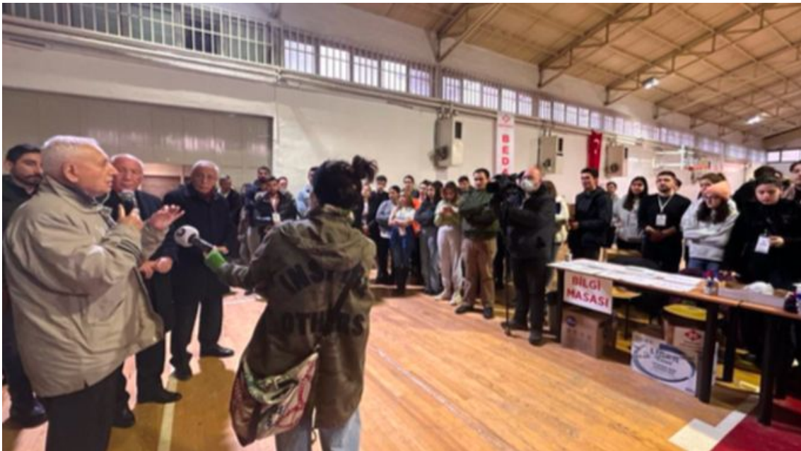
Baskent University helps the victims of this tragedy hoping to relieve their grief to some extent.