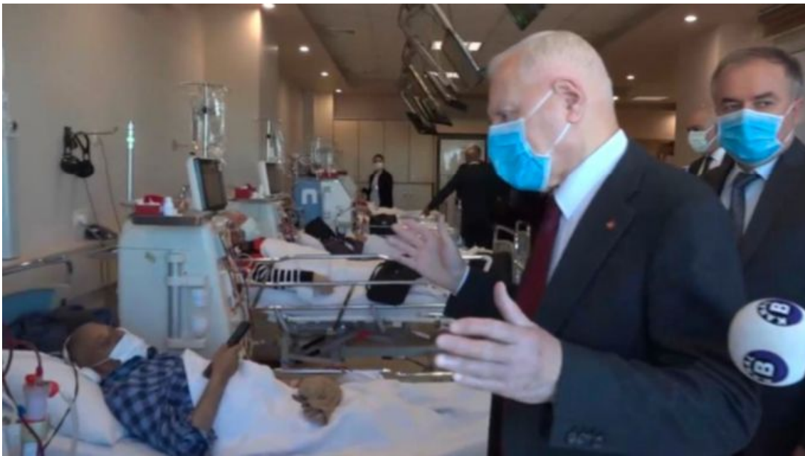
Patients who were brought to Baskent University Adana Hospitals and dialysis centers