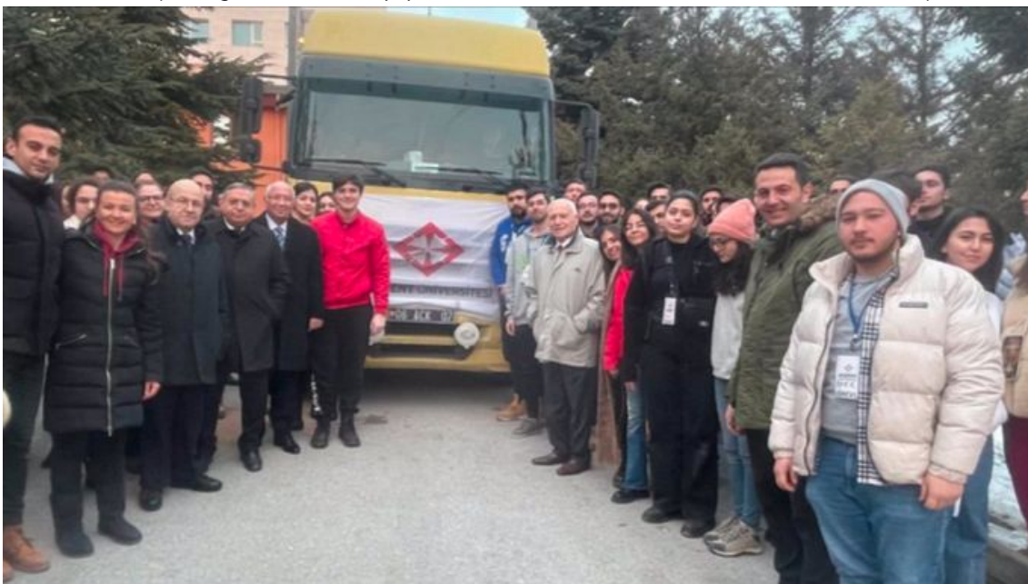
The 10th truck that was sent to the earthquake zone