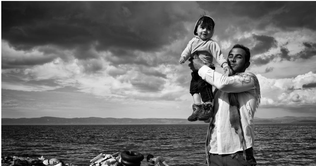
Lesbos, Greece, October 2015: A father celebrates with his child on the Greek island of Lesbos after a stormy crossing with his family over the Aegean Sea from Turkey.